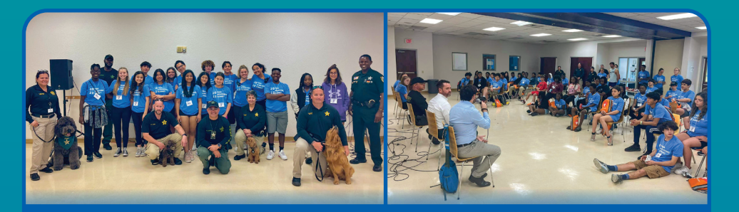
Palm Beach County Sheriff deputies stopped by our Boca Y's Teen Achiever's Summit Career Fair to answer questions and provide motivation. Thank you for your support of our teen programs!