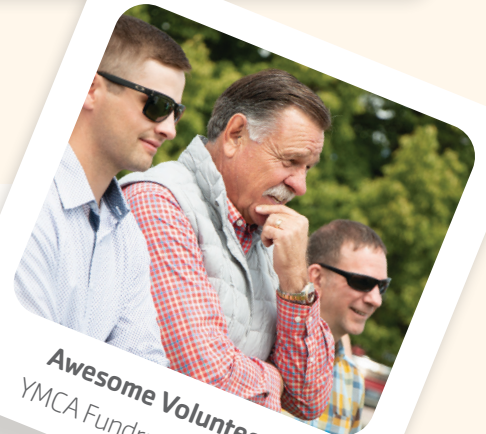
Awesome Volunteers! YMCA Fundraising Meeting