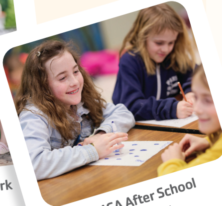
YMCA After School Spring '24