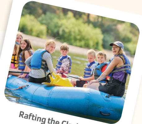
Rafting the Clark Fork Summer Camp '24

*We are still working to fully fund these areas. Contact us at 406-532-6261 to learn how you can give a gift to help us raise the final $1.5 million by December 31!