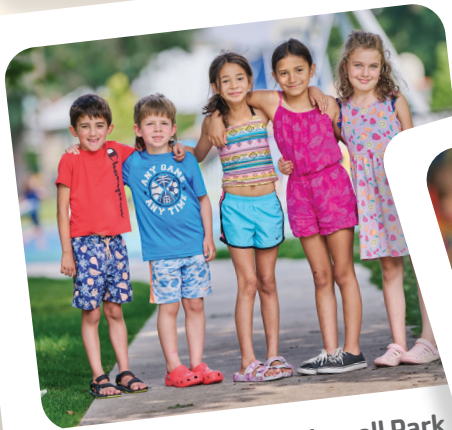
Camp Field Trip to Lowell Park Summer '24

Family Locker Room Administrative Offices Phyllis Washington Early Child Care Center