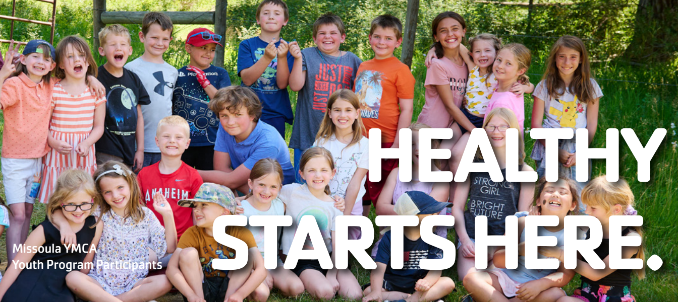
Missoula YMCA Youth Program Participants