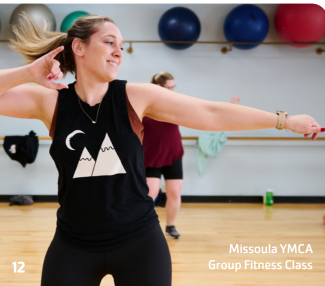
Missoula YMCA Group Fitness Class

High Intensity Interval Training (HIIT). Minimal equipment, maximum cardio and calorie burn.