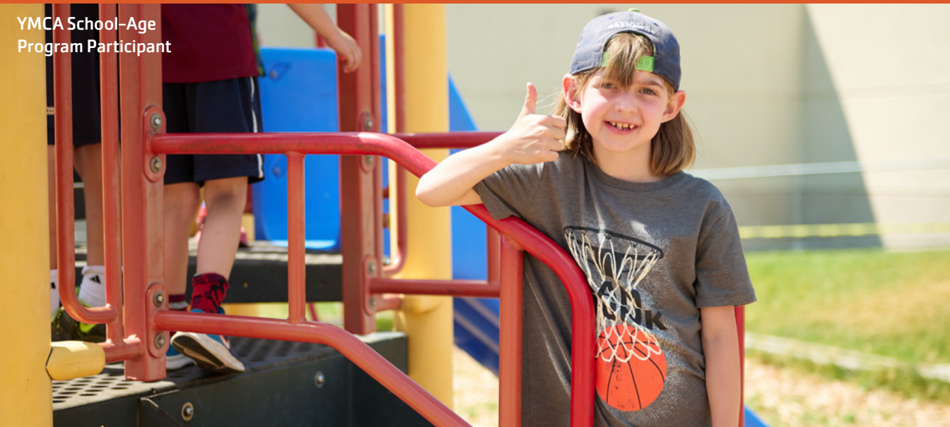
YMCA School-Age Program Participant

We are committed to supporting your family throughout the year! Our programs include after school care for students in grades K–5. We also offer full-day child care on no-school days. During summer months, we offer camp options for campers of all ages. Registration is required for all programs. Financial assistance is available.