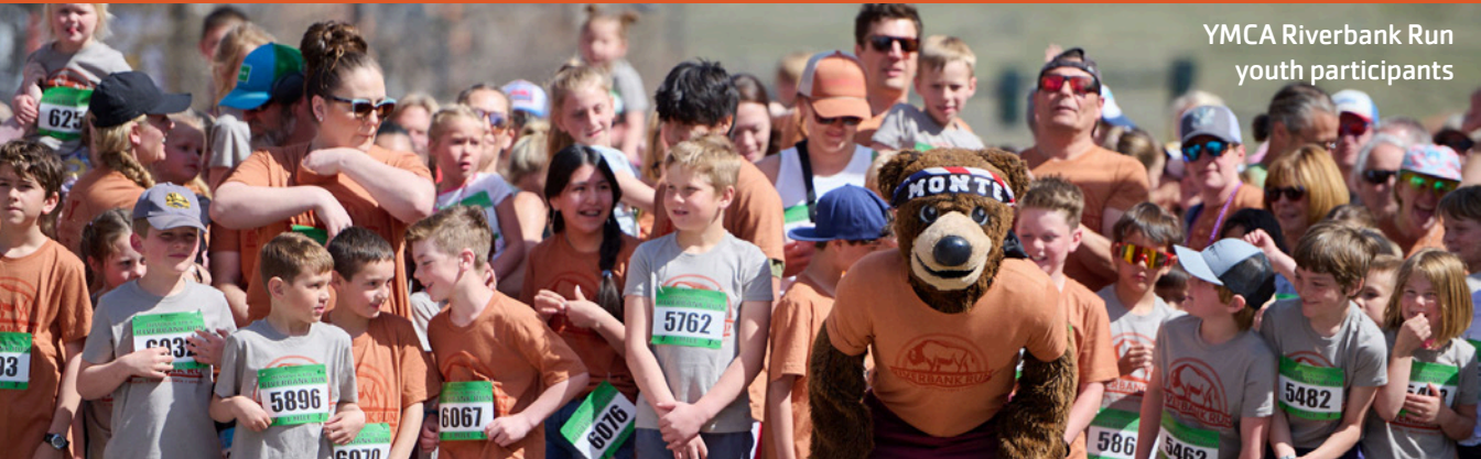
YMCA Riverbank Run youth participants

Everyone knows the Y as a place to swim, play basketball, and exercise. Yet the Y is so much more! As a 501(c)3 nonprofit, we provide critical programs and services to nearly 15,000 individuals each year. Through generous donor and sponsor support, we are able to make all of our programs and services accessible to countless children, teens, adults, and families who live in and around Missoula County.