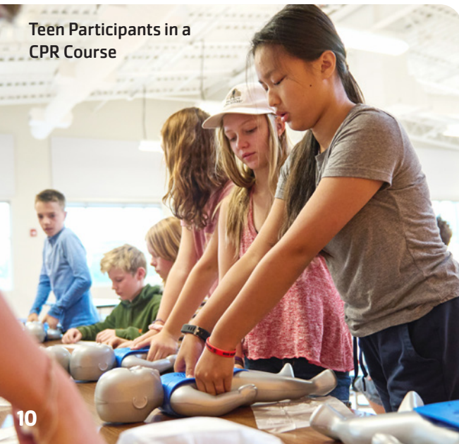
Teen Participants in a CPR Course

We offer group fitness classes that meet every fitness level, every schedule, and every goal. Classes are included with Y membership and members may attend as many classes as they wish. No registration required—find the class that's right for you and show up ready to work out!