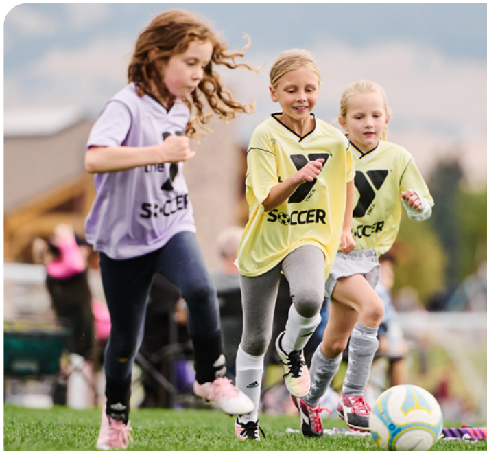
Missoula YMCA Youth Soccer Players

Our clinics and programs give young athletes opportunities to try new sports and develop skills alongside friends! We offer a variety of options throughout the year including Flag Football, Homeschool PE, Volleyball, and Rookie Sports.