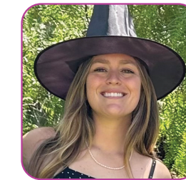
REMI Travel Camp Director