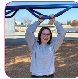
MADI TK-1 Director