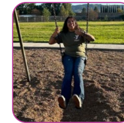
SOLIEE 2nd-5th Director