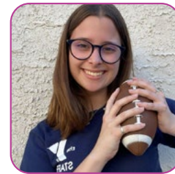
MADI TK-1 Director