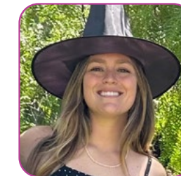
REMI Travel Camp Director