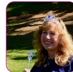
DORI Middles Director