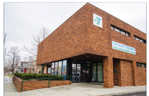
Child Development Center